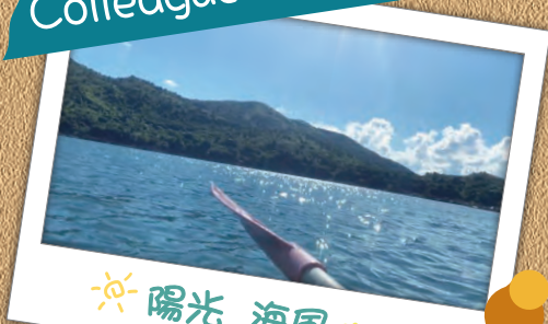
☀️ 陽光 海風