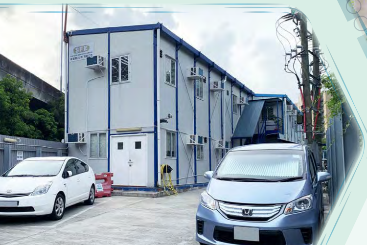
Original image of Kam Tin site office building