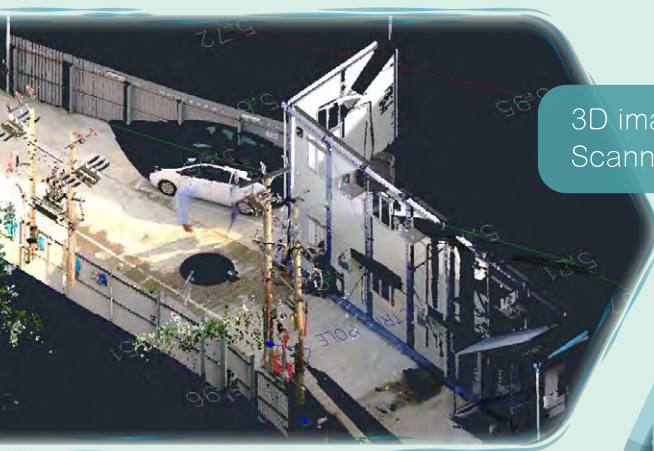
3D images of the Kam Tin site office building - Scanned by a 3D Laser Scanner

3D laser scanning technology is a method of high-accuracy mapping that uses laser beams to capture the dimensions and spatial relationships of physical objects. It works by recording angles and distances through analysis of laser light reflections. 3D lasers can scan objects up to several hundred meters in the blink of an eye and output digitized records with a high level of accuracy.