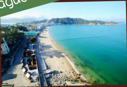
20 my sfk memories 20