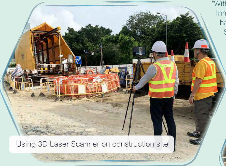
Using 3D Laser Scanner on construction site